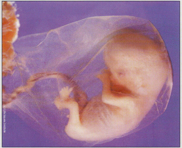
Eight weeks after conception.

Jesus said, "Whoever desires to come after Me, let him deny himself, take up his cross, and follow Me. For whoever desires to save his life will lose it, but whoever loses his life for My sake and the gospel's will save it."